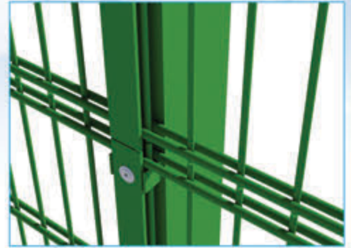
● Showing the clamped joint